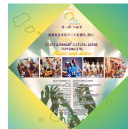
P1 – Man: Cabo Verdean Identity and Culture