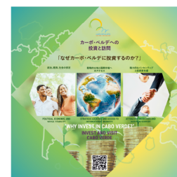
P5 – Woman: Sustainable Investment Opportunities