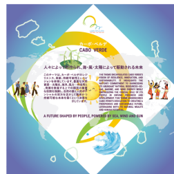
P2 – Wind: Sustainable Transformation

The pavilion is composed of five cubes, each representing a pillar (P):