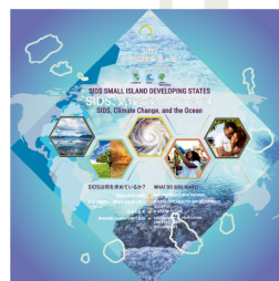
P4 – Sea: Blue Economy and Marine Preservation